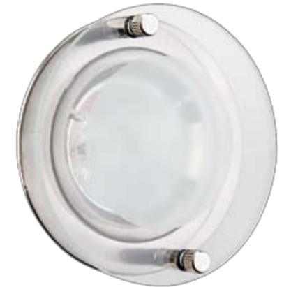
Round, Brushed Chrome Fitting, including glass fascia with inner frosting.