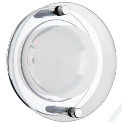
Round, Chrome Fitting, including glass fascia with inner frosting.