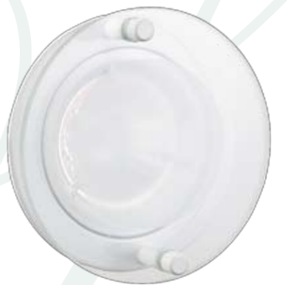
Round, White Fitting, including glass fascia with inner frosting.