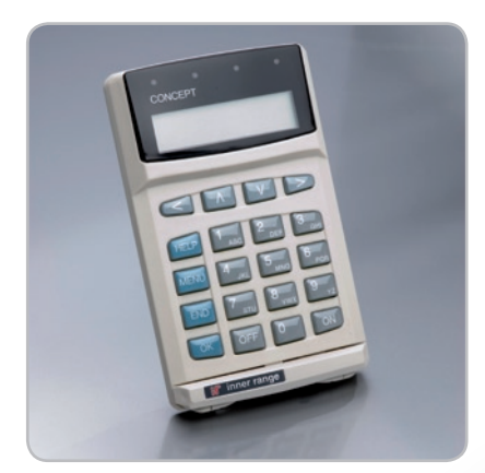
995000UWH Universal Elite Terminal (white)

995000U Universal Elite Terminal (ivory)