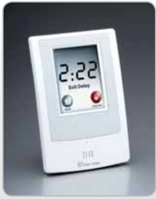
Part Number: 995022NOTRIM

Touchscreen Terminal (Ivory). WITHOUT FACE PLATE*. Supplied with adhesive for custom face plate