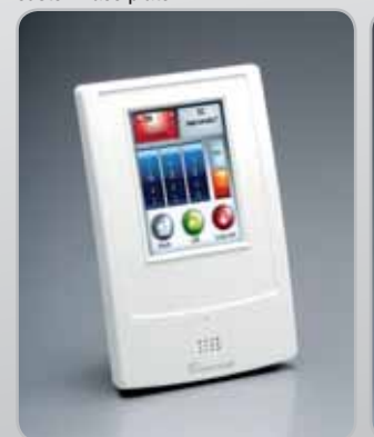
Part Number: 995022CHN0TRIM

Touchscreen Terminal (Ivory). WITHOUT FACE PLATE*. Supplied with adhesive for custom face plate