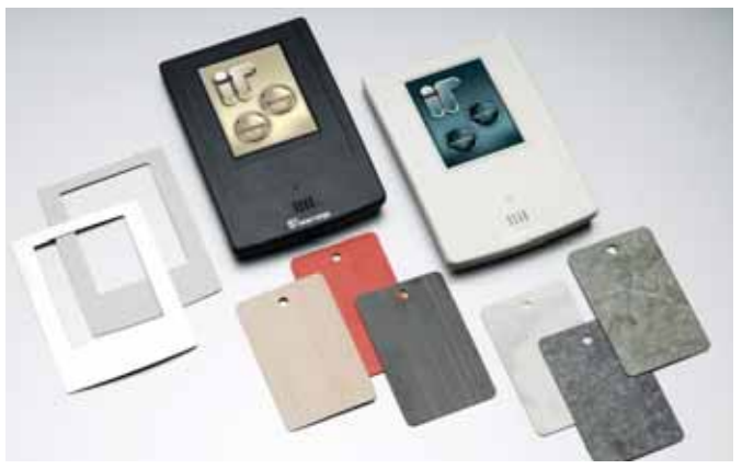
Match the installation décor with custom face plates