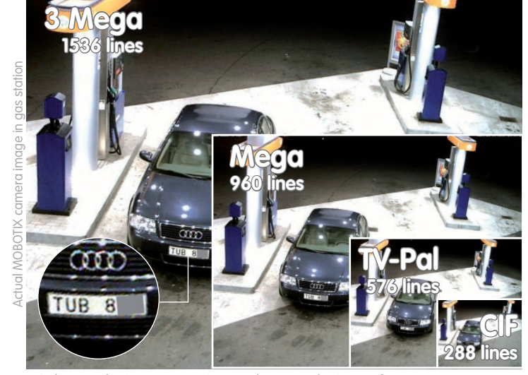
High-resolution – 30 times the resolution of a CCTV camera MOBOTIX HiRes Video enables positive identification of people and objects up to 100m away