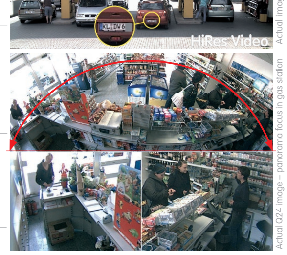
1 Hemispheric camera provides 180° overview and two close up views