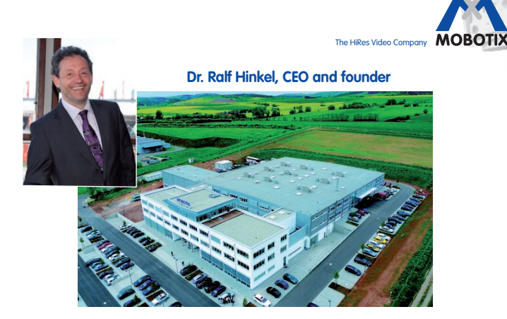
MOBOTIX is ranked as no.1 megapixel security camera manufacturer.

The innovative camera design also features a weatherproof form factor, no moving parts and unrivalled robustness ensuring a longer product lifecycle – resulting in a lower total cost of ownership over the life of the product.