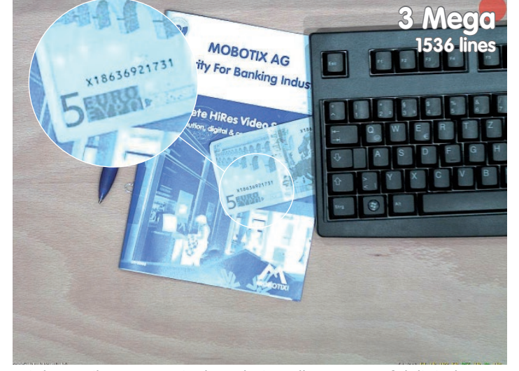
High Detail – 3 megapixel resolution allows powerful digital zoom MOBOTIX HiRes Video can even capture the serial number of a bill from a distance of two meters