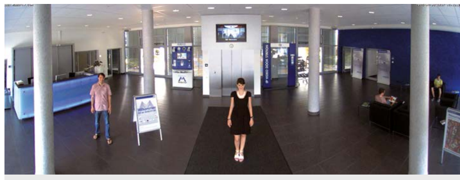
180° panorama image